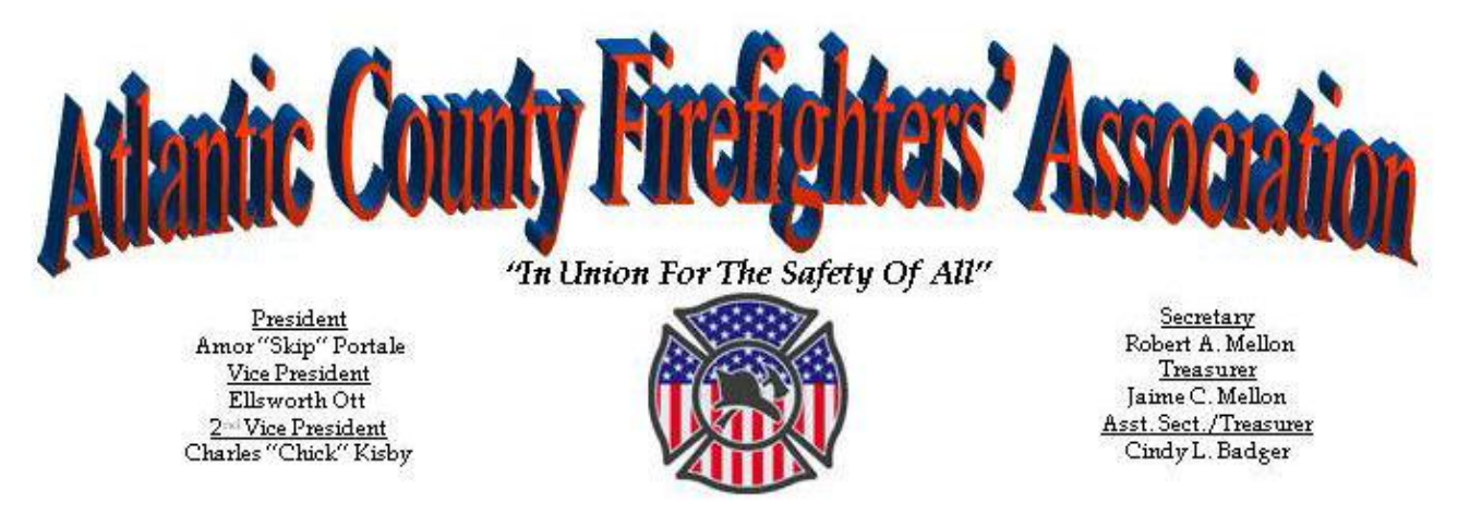
December 15, 2010